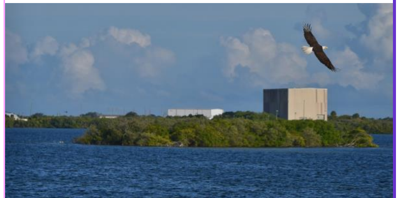
Bald eagle over the Indian River Lagoon.

'We the people' do this by creating a constitutional Right to Clean Water.