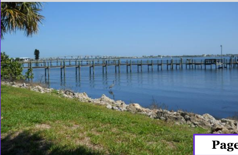
Indian River Lagoon.

There may be just enough time to undertake this sacred duty to clean and restore Florida’s waters to a portion of health and to their rightful glory. Just maybe. This is in your hands now.