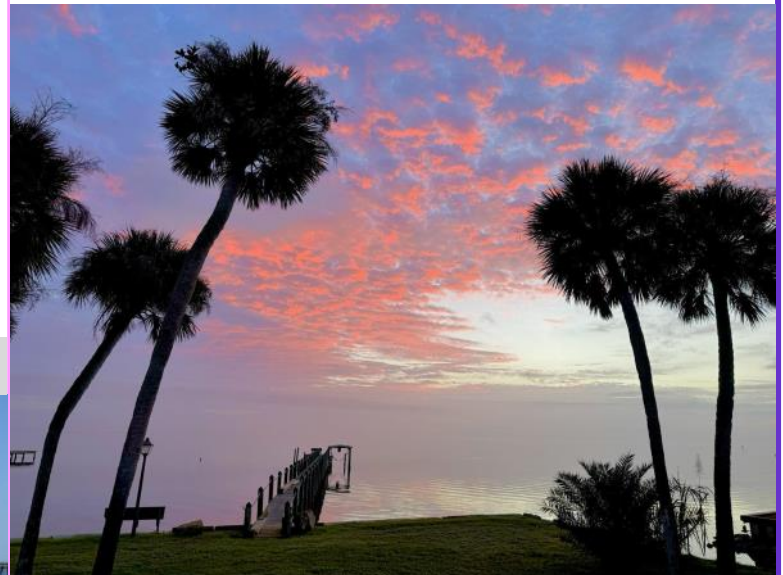
Sunset over the Indian River Lagoon.