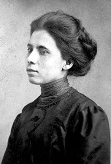
Jovita Idár has gained fame in recent years, as historians, journalists and documentarians have highlighted her work as an early 20th-century Mexican American journalist and activist. Idár also was a faithful Methodist who late in her career edited the Rio Grande Conference newspaper.